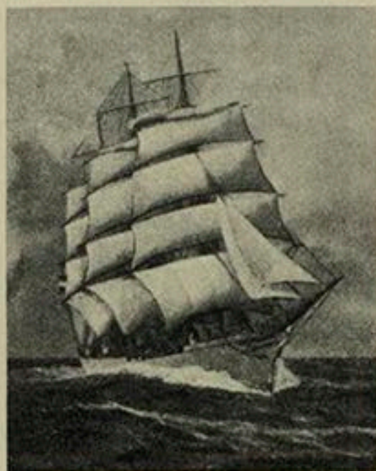
4-m msk. "HERZOGIN CECILIE"

Telegramadress: "GUSTAFERIKSON" Mariehamn