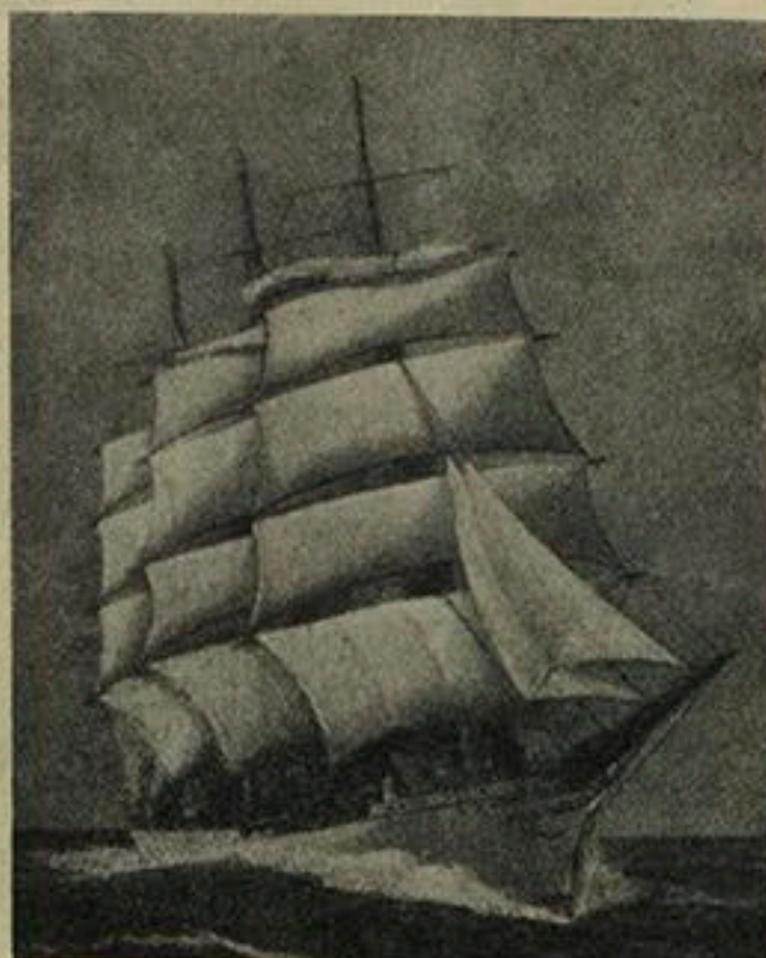
4-m bk. „HERZOGIN CECILIE“

Bygger och reparerar fartyg samt utför alla slag av mekaniska, gjuteri- och svetsningsarbeten