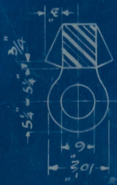
GUDGEON WITH STOPPER.