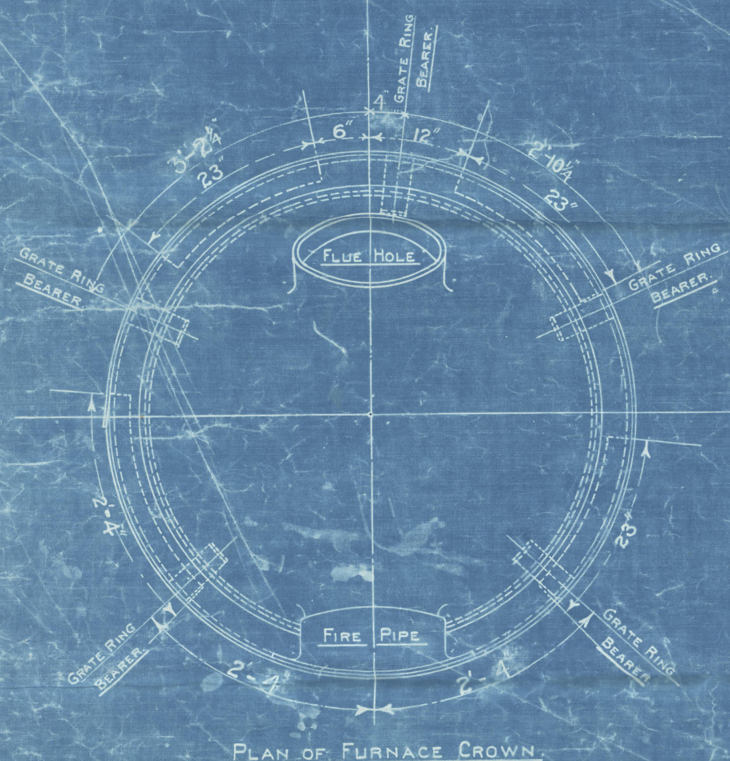
PLAN OF FURNACE CROWN