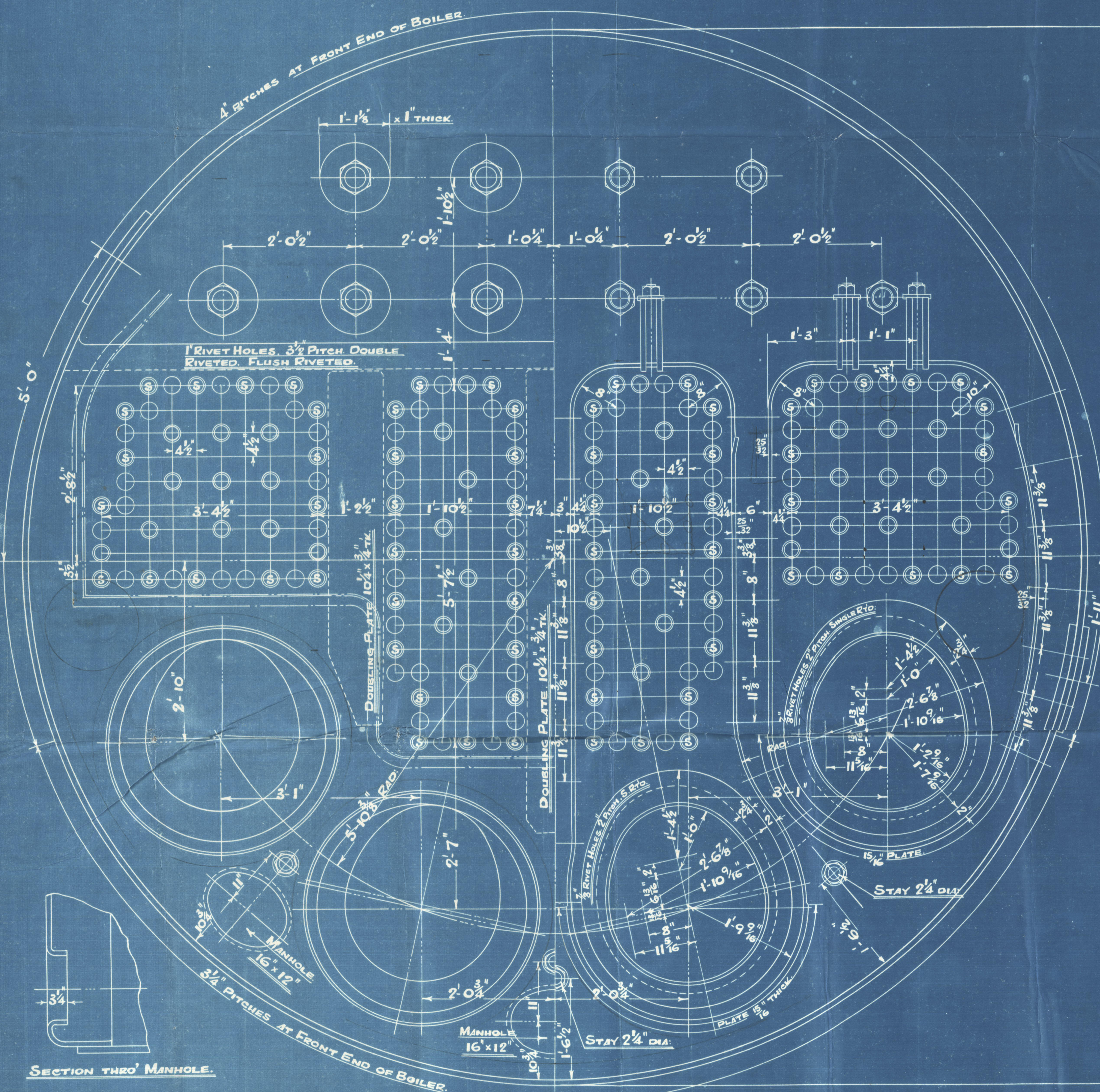
SECTION THRO' MANHOLE.

DRAWN BY J.A.S. TRACED BY M.R.A.D. CHECKED BY J.A.S.